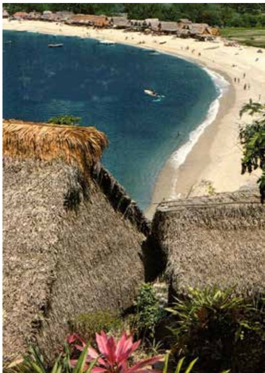
Figure 16. Yelapa Beach, photograph by Leslie Korn (2001).

after giving birth. She covers her head and forehead because the skin pores are open—the covering protects lest punzadas (stabbing pain) from developing behind the eyes or in the ears. The woman does not eat eggs or pork because ingesting those foods causes a bad smell in the body. Only eat meat—carne asada, machacada fried. One does not eat beans so the infant does not develop empacho [indigestion]—it will be healthier.