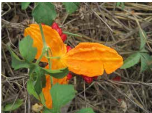
Figure 12. Bitter Melon ( Mormordica charantia L.).

indigenous medicines and the resultant loss of traditional knowledge. Many of these plants, like mormordica charantia L. (cucurbitaceae), which grew alongside the dirt paths, were all but gone from the village by the 1990's. Others, such as nopale prickly pear cactus ( Opuntia sp.), while still grown are decreasingly utilized. Still other plants—like breadnut ( Brosimum alicastrum ), which, along with chaya, was a diet staple—are poised to become the next “designer food” for import into the U.S. The breadnut or capomo, as it is known in the Comunidad is rich in amino acids (Brucher, 1969) and used traditionally as a beverage and food for human nourishment to increase lactation in humans and animals alike.