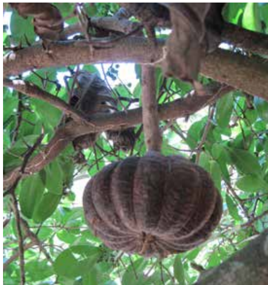
Figure 14. Gaho ( Hura polyandra ), photograph by Meredith Parr (2010).

In Talpuyequé there are about 40 persons and only a few people and I use herbs. They say: "Cook estafiate tea" and when kids have a cold, we cook it. I put on them hen fat, for coldness and then ruda, albaca—very good for colds or flu. I place