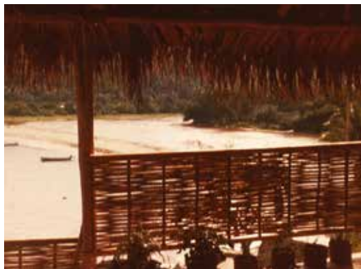
Figure 4. Author's home, photograph by Leslie Korn (1976).

Yelapa, one of the main village settings for our research, is a small village in the state of Jalisco, located between a maximum latitude of 20°30' and minimum latitude of 20°15' and a maximum longitude of 105°30' and a minimum longitude of 105°15'. It hugs the southern shore of the Bahía de Banderas (Bay of Flags), approximately 40 minutes by boat southwest of Puerto Vallarta at the mouth of the Rio Tuito. It is part of the tropical sub-humid zone. Yelapa is in the heart of the tropical forest. In Yelapa, rainfall amounts to 1,200 to 1,400 mm between May and October and from