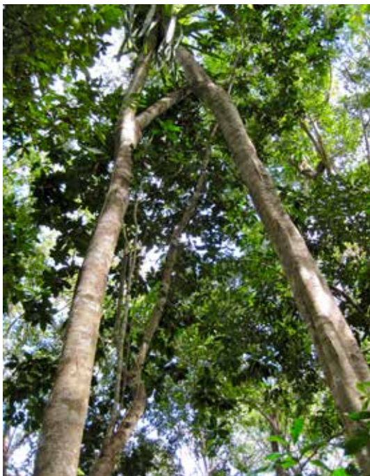
Figure 5. Capomo ( Brosimum alicastrum ) trees, photograph by Leslie Korn (2001).

a phenologic perspective, it is more similar to the deciduous forest. During the months of rainfall vegetation is green, though during the drought season half of the trees in sub-deciduous tropical forests lose their leaves and go dormant, while other trees remain green or only lose their leaves for a short period of time.