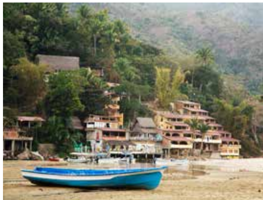
Figure 2. Yelapa Hillside, photograph by Meredith Parr (2009).

The region is a microcosm of rural Mexico's growing chronic health problems with diabetes, heart disease, arthritis, and pain. The bi-directional migration pattern of Mexico's sons and daughters immigrating to the United States, and US retiring "snowbirds" flocking to