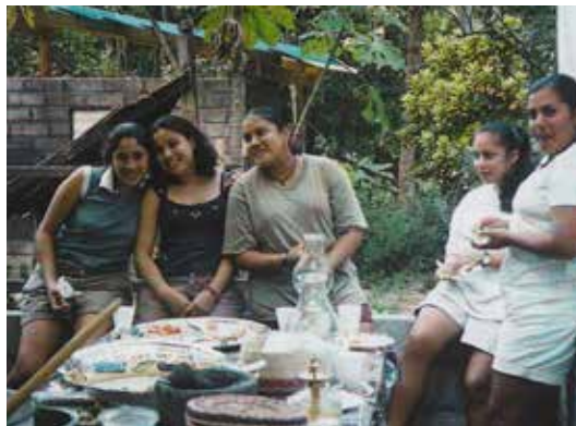
Figure 11. Teens in the plant medicines group, photograph by Leslie Korn (1999).

México is one of the most biologically diverse regions in the world, with over 30,000