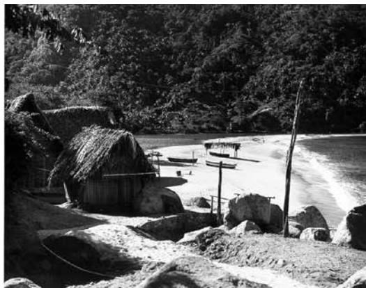
Figure 17. Yelapa Beach, photograph by Robert Harper (1958).

One is in cuarentena for 40 days and during the 3 days puts on medias (thick stockings), and does not have sex. No one practices it now. Now they say if you have [sexual] relations you get empacho. For