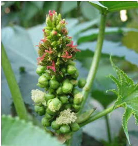
Figure 13. Castor bean flowers ( Ricinus communis)